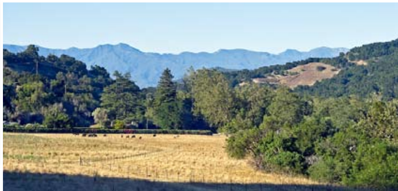
Photo left: Steelhead Preserve from the south; Ventura River beyond trees on the right, future conservation center is mid photo by the giant redwood. Les Dublin.