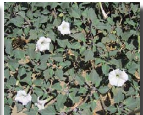
Giant Blazing Star, Steelhead Preserve Jimson Weed, Steelhead Preserve