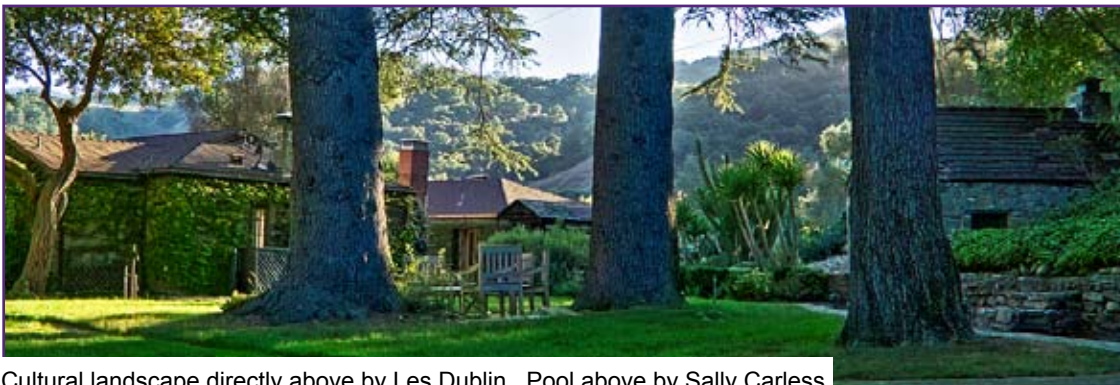
Cultural landscape directly above by Les Dublin. Pool above by Sally Carless.

With the acquisition of the one-mile long Ventura River Steelhead Preserve, roughly 6 miles of the 16 mile long Ventura River are now permanently protected. Along these 6 miles, and as envisioned for the remaining 10 miles, the OVLC and its partners are creating a Ventura River Parkway with the primary goal of