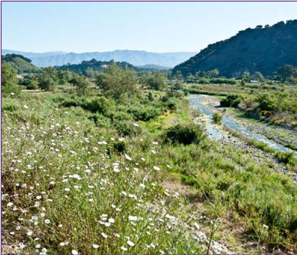
View to the north from the middle of the new Ventura River Steelhead Preserve. See map of the new preserve on page 6.