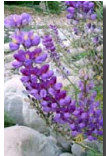
Beautiful Lupine found on the Ventura River Preserve.